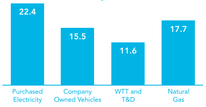
Figure 2: GHG Emissions (tCO<sub>2</sub>e) by Activity (2020-21)